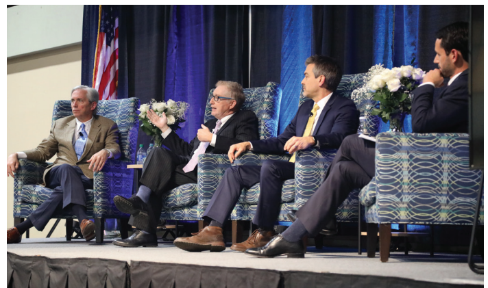
Leaders from X-energy, Grant PUD, and Energy Northwest discuss next generation nuclear at the 2021 Public Power Forum.