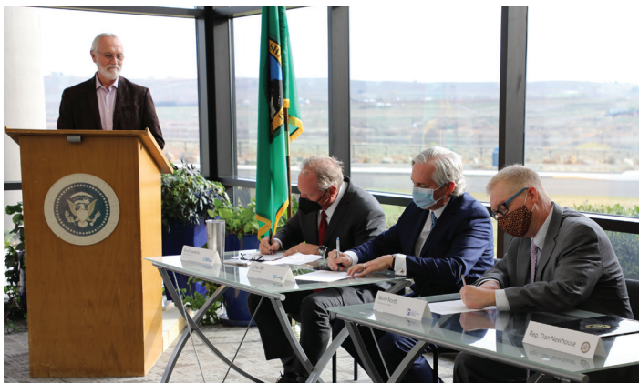
X-energy, Grant PUD, and Energy Northwest launch the TRi Energy Partnership on April 1, 2021 in Richland, Wash.

Utilizing TRi-structural ISOtropic (TRISO) particle fuel – the most robust encapsulated fuel – the Xe-100 is meltdown-proof and “walk-away safe.” The more energy dense high-assay low enriched uranium (HALEU) fuel also allows for longer periods of operation, which greatly reduces fuel costs. This fuel also allows the plant to have a much smaller footprint and safety perimeter, compared to traditional plants. The Xe-100 is also cost-competitive and affordable. Module size and weight allows transportability using existing road and rail infrastructure, leading to groundbreaking timeline and cost controls.