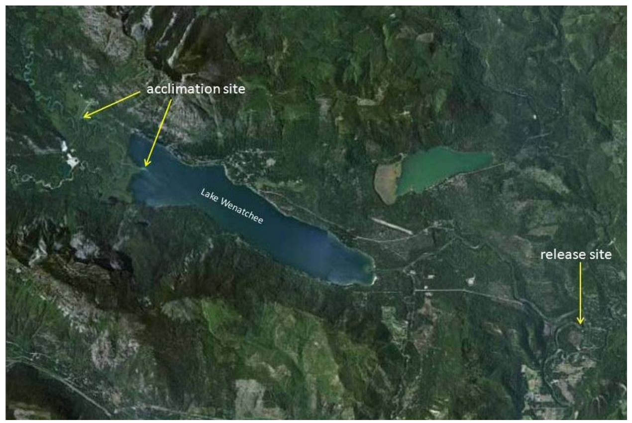
Figure 2. Acclimation and release sites for Grant PUD's 2013 White River spring Chinook short-term acclimation program.

Background: Brood-year 2010 Outmigration Survival Summary from 2012 Releases All BY10 fish were acclimated for six weeks (March 27 – May 9) in eight tanks at the bridge site, and were transported via truck for release into the Wenatchee River at the Chiwawa Hatchery water-intake site.