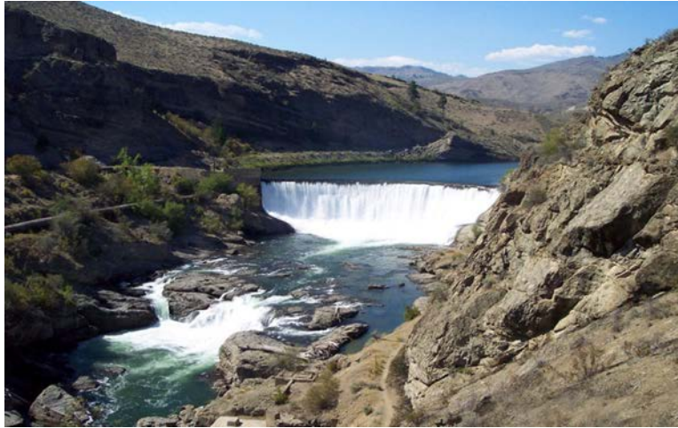
Exhibit B Project Location