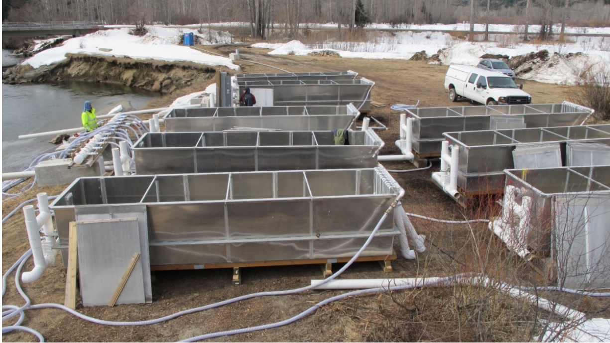
Figure 4 White River portable acclimation site for spring Chinook salmon.