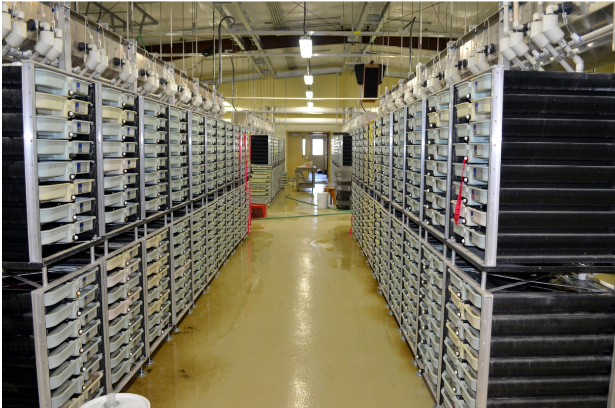
Figure 6 Priest Rapids Hatchery incubation room.

Grant PUD, in consultation with the PRCC, developed the Priest Rapids Hatchery facilities improvements as outlined in Section 9.6 of the SSSA. The design for the renovated facility included capacity to rear the approximately 5.6 million fish program plus capacity for additional smolts. The facility, which produces both Grant PUD's current mitigation requirements, and 1.7 million smolts and 4.1 million eyed-eggs for the U.S. Army Corp of Engineers John Day Mitigation program was completed in 2014. Priest Rapids Hatchery is a full life-cycle facility, so all life-stages necessary to produce the program, from brood collection to acclimation and release, occur within the hatchery grounds (Figure 6). Additionally, natural origin broodstock integration goals into the program are primarily met through broodstock collection efforts at the Off-Ladder-Adult-Fish-Trap (OLAFT) on the Priest Rapids left-bank fish ladder through 2019, and through volunteer hook-and-line efforts to collect wild, spawning adults in the Hanford Reach of the Columbia River. Annual release numbers can be found in Table 16.