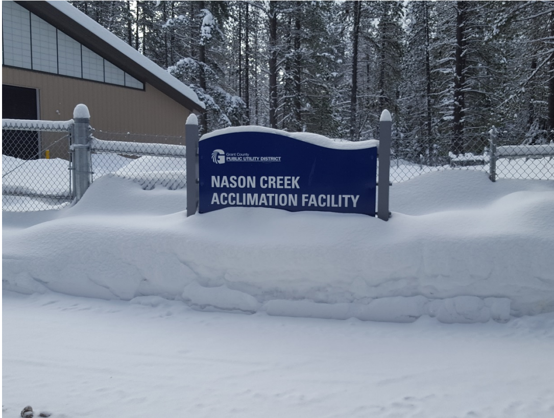
Figure 5 Nason Creek Acclimation Facility.

acclimation in October. Fish are released the following spring, typically in mid- to late-April. Annual release numbers, locations and stock origins can be found in Table 16.