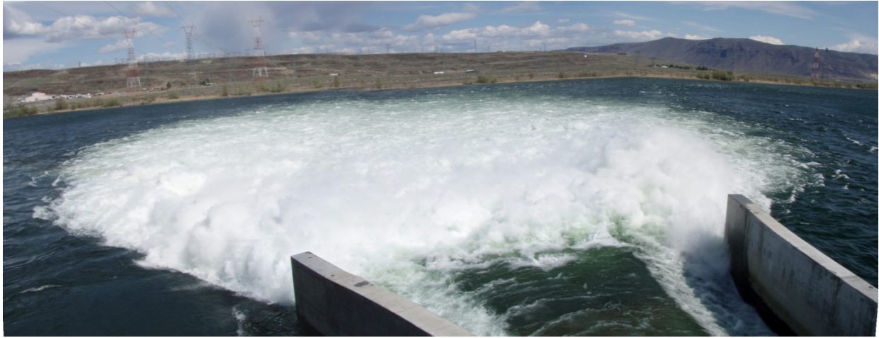
Figure 1 Photograph of Wanapum Dam Fish Bypass facility, looking downstream, mid-Columbia, WA.

The Wanapum Fish Bypass (WFB) was completed in early 2008 and began operation during the start of the annual fish-spill program on April 30, 2008 (Figure 1). The WFB was designed to operate at different flow volumes (20, 15, 10, 5 and 2.5 kcfs). As reported in the past, when tailwater drops below an elevation of 488.0', the outflow from the WFB (at 20 kcfs) becomes unstable and starts to undulate, causing a condition that is believed to be less conducive for migrating juvenile smolts and possibly producing greater TDG. At this lower tailwater elevation, when the outflow from the WFB is reduced, this undulating jet (of water) is returned to a surface-skimming flow, which is better for fish passage. Grant PUD, in consultation with the PRCC, agreed to maintain the Wanapum tailwater elevations to the best of its abilities to stay within the range of 488.0 to 498.0 feet during the salmonid out-migration season during non-extreme river condition periods. During the 2022 salmonid smolt out-migration, the WFB was operated continuously at 20 kcfs.