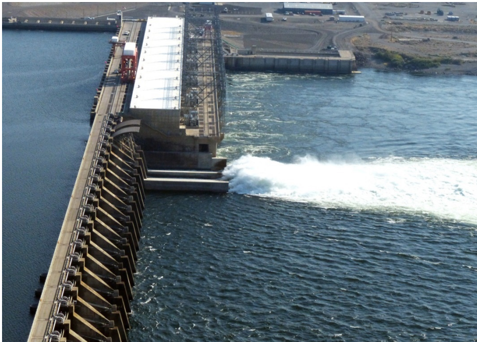
Figure 2 Priest Rapids Fish Bypass in operation, April 2014.

During the 2022 smolt out-migration season, the PRFB was operated to pass juvenile salmonids and steelhead. The PRFB was designed to operate at a fixed-flow volume of 27 kcfs. Fish-spill began on April 19 and ended on August 24, 2022. Involuntary spill was passed through the remaining spillway gates at Priest Rapids. Grant PUD, in consultation with NMFS and the PRCC, using near real-time TDG and flow information to adjust/modify spill patterns as necessary.