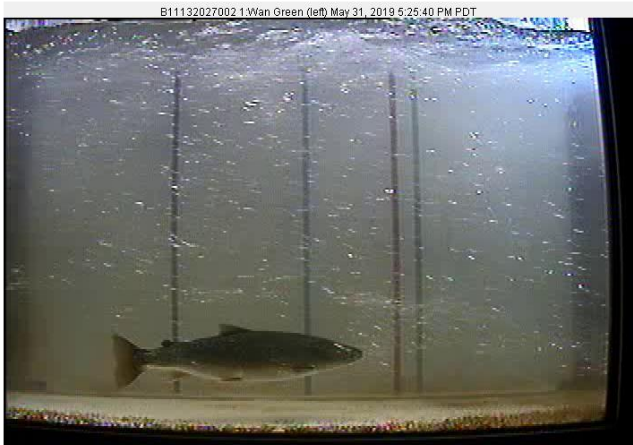
Figure 1 A bull trout with an estimated length of 24 inches passing Priest Rapids left bank count station on May 31, 2019.

Daily fish passage through Priest Rapids and Wanapum dams can be viewed at the following link: http://www.grantpud.org/environment/fish-wildlife/fish-counts